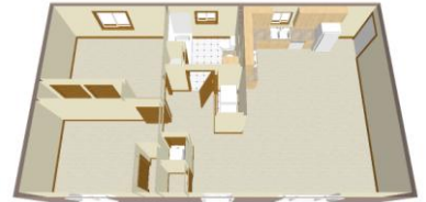
Standard Two-Bedroom Layout

To learn more about the Governor's House Program or if you know of someone who might want to have information or purchase the home, please have them contact the CSDED Office.