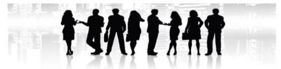
Population Change: 2000 and 2010