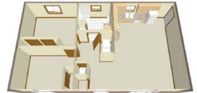
Standard Two-Bedroom Layout

To learn more about the Governor's House Program or if you know of someone who might want to have information or purchase the home, please have them contact the CSDED Office.